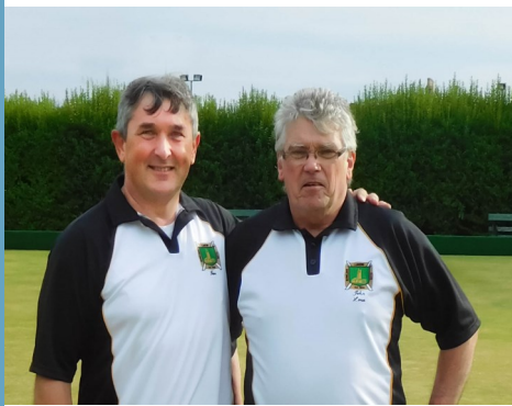
Championship finalists looking very smart in their Club shirts

We have been delighted to receive sponsorship from Campion Homes during the year. This has enabled us to obtain the smart new Club shirts, which have been much admired.