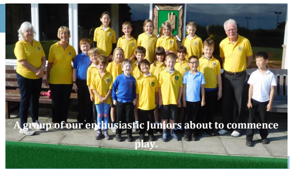
A group of our enthusiastic Juniors about to commence play.